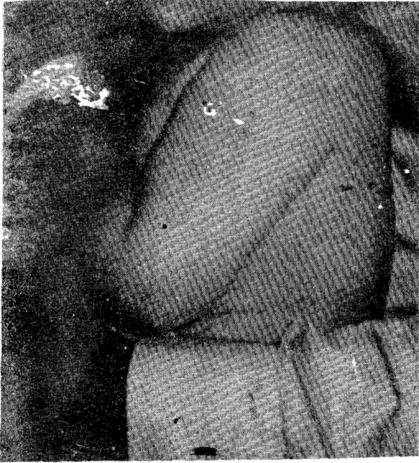
Figure 1. Localized hypertrichosis on the left shoulder of the patient, six months following BCG immunization.

immunodeficiency virus (HIV) infection and limitations in health care services to high-risk populations. The only vaccine available against tuberculosis is still the Bacille Calmette-Guérin (BCG). 1 The efficacy rate of the vaccine in protecting against TB ranges from 0 to 80 percent. A meta-analysis of data from 14 prospective trials and 12 case-control studies of BCG efficacy showed that the vaccine reduces the risk of tuberculosis by an average of 50 percent, 2 the prevention rate reported in Turkey is about 80 percent. 3 This vaccine does not contain any additive or preservative and the preferred route of administration is intradermal injection.